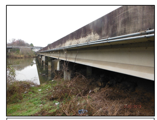
Photo 1 – I-26 Bridge over Saluda River in Richland/Lexington, SC.

The existing bridge structure (~705.0'L x 116.0'W, inside curb to inside curb), is located on I-26 in Richland/Lexington County, South Carolina. The actual date of construction for the original bridge structure is unknown. The bridge was widened from it's original construction in the late 1980's. The structure is a six (6) lane bridge constructed with a poured-in-place concrete bridge deck, with concrete curb and gutters and consists of nine (9) bridge deck spans. The original bridge deck spans are supported by five (5) precast horizontal concrete beams and concrete diaphragms, supported by concrete piers and poured in place concrete bent caps. The widened section of the bridge is supported by three (3)